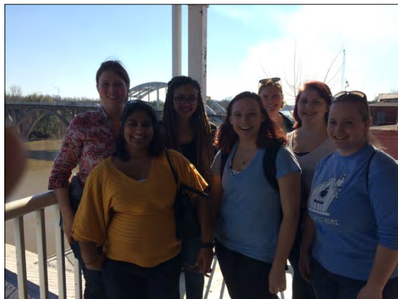
Above: Group members stand in front of Edmund Pettus Bridge, the historic scene of Bloody Sunday Below: Group members prepare lunch for families living at the Nicholas House, a transitional shelter for poverty-stricken families

This trip is one is meant to help the students who participated bring back what they learned on the trip and spread that knowledge to those across the Etown campus. The group will be working to spread this inspiration both through programming and possibly through added curriculum across academic areas if possible. Programming and curriculum such as this will work to increase the diversity knowledge and atmosphere throughout the College and, hopefully, will inspire many students to take part in social justice initiatives and to stand up for what they believe in – no matter the struggle.