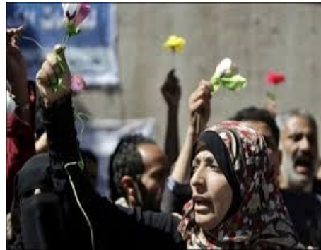
Tawakkol Karman, 2011 Nobel Peace Prize winner, is known as the "mother of the revolution" and "the iron woman."

T awakkol Karman received the Nobel Peace Prize for her role in the 2011 Yemeni protests. She is only the second Muslim woman—and youngest person ever—to be selected for the award. The Center for Global Understanding and Peacemaking is proud to announce Karman as the 2014 Ware Lecturer.