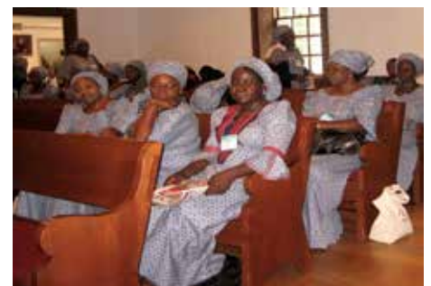
Members of the EYN women's choir and fellow church members visit the Young Center.