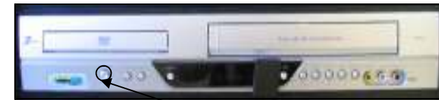
*4. Power Button