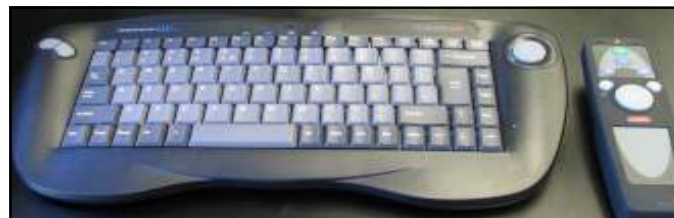
Wireless Keyboard (left) and Wireless Mouse (right)