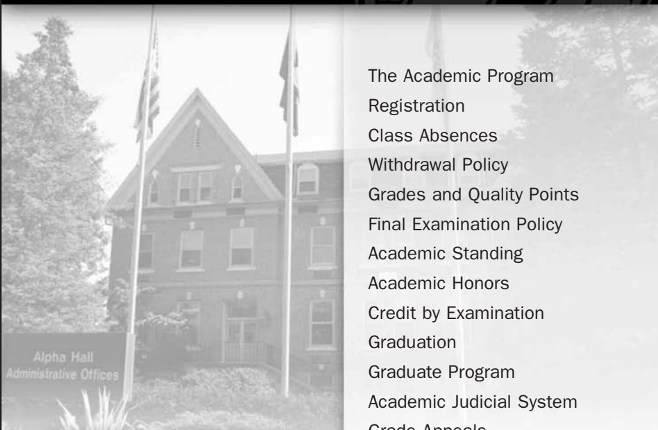
Alpha Hall Administrative Offices