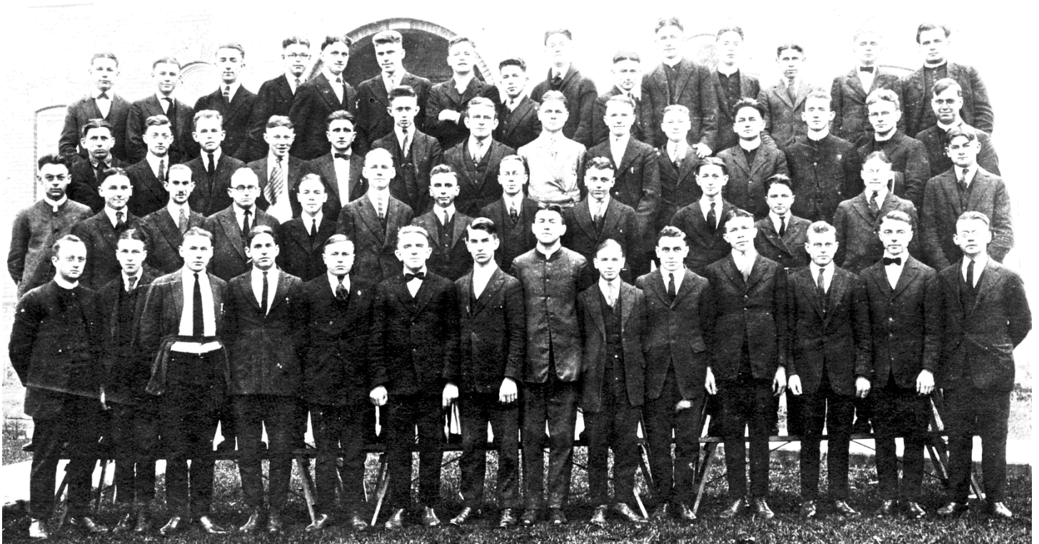
Young Men's Welfare Association standing in front of Rider Memorial Hall in 1920 1

During the academic year 1920-1921 two student groups were established at Elizabethtown College to “foster the spirit of helpfulness and to support such projects as will contribute to the common good.” These groups were called the Young Men’s Welfare Association and the Young Women’s Welfare Association. These groups evolved during the 1926-1927 academic year into membership with the national Young Men’s Christian Association and Young Women’s Christian Association.