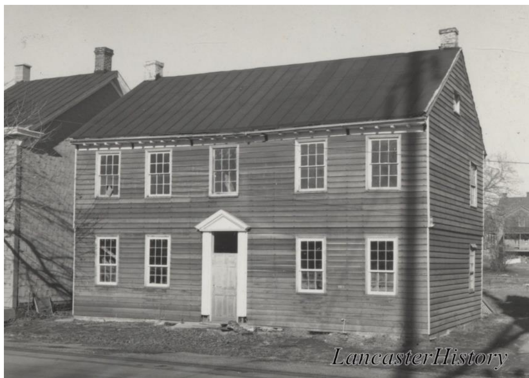
220 West Front Street, 1972.