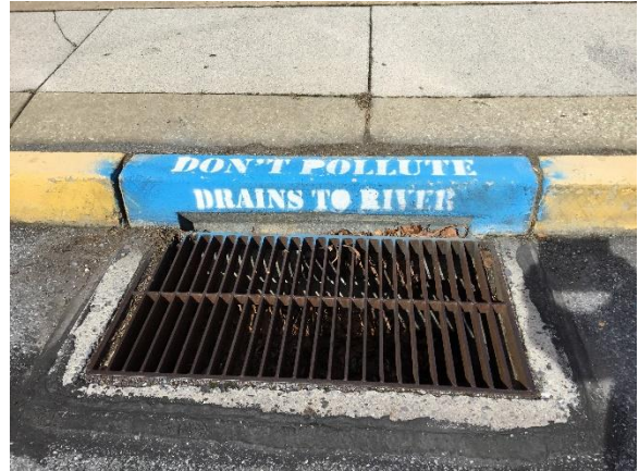
Corner of East Market & North New Haven Streets Marietta, Pennsylvania

humanities project: ArcGIS story maps. Students’ reports were used by PennDOT, Elizabethtown Borough, and the federal Department of Transportation regarding historic preservation initiatives and public works projects concerning rebuilding the Market Street Bridge.