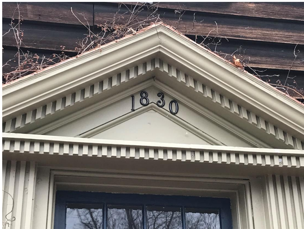
220 West Front Street, 2020