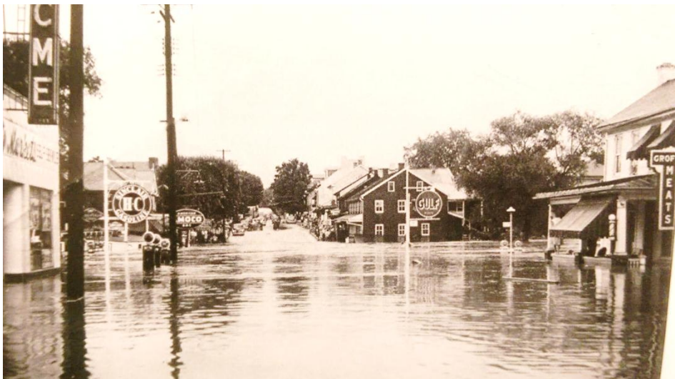
Market Street facing North after the 1945 Flood. Groff's Meats at its original location at the left.