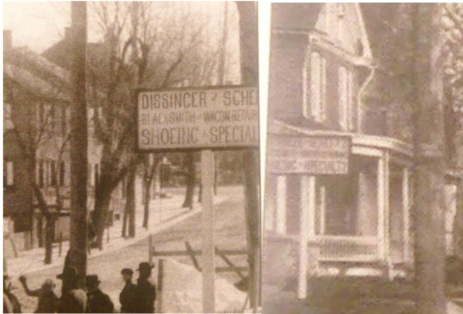
1912 Construction of the Conoy Creek Bridge. Dissinger and Scheetz Blacksmith sign on the west side of North Market Street.