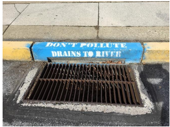
Corner of East Market & North New Haven Streets Marietta, Pennsylvania

In the spring of 2017 the course, “Elizabethtown History: Campus and Community,” involved a partnership with PennDOT. Students engaged in archival and field research to conduct National Historic Preservation Act Section 106 Reviews of local historic properties. Student research findings were published through the digital humanities project: ArcGIS story maps. Students’ reports were used by PennDOT, Elizabethton Borough, and the federal Department of Transportation regarding historic preservation initiatives and public works projects concerning rebuilding the Market Street Bridge.