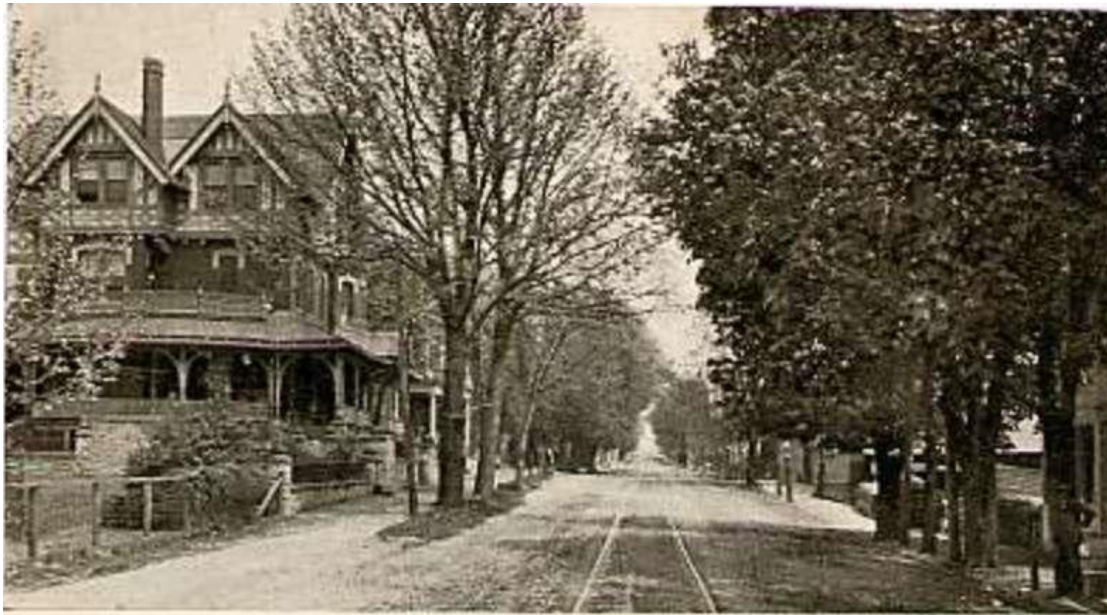
EAST MARKET STREET LOOKING EAST, MARIETTA