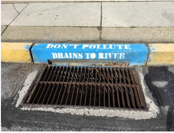
Corner of East Market & North New Haven Streets Marietta, Pennsylvania