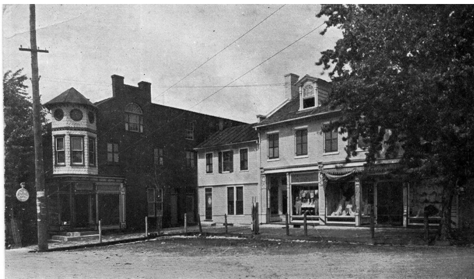
Northeast Corner, Center Square, Elizabethtown, Pa.