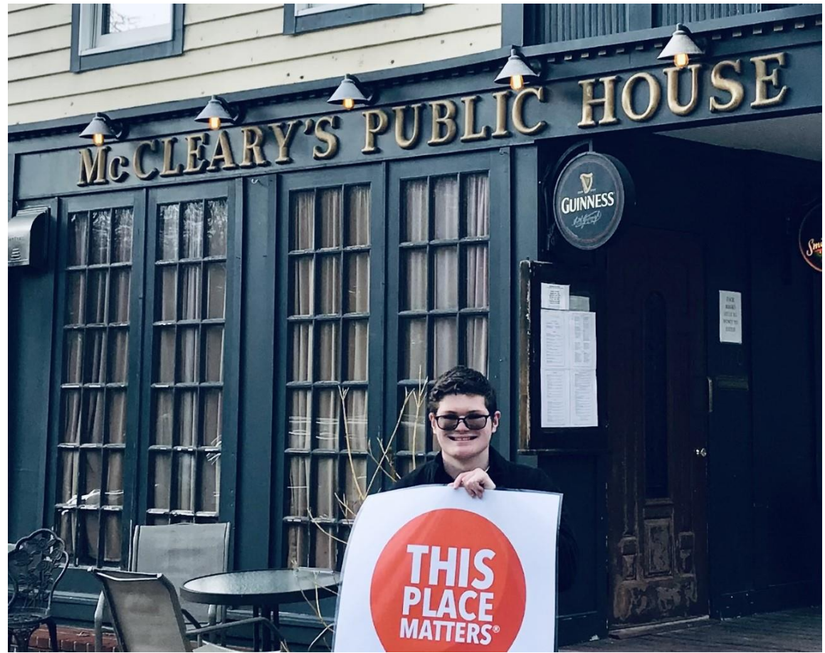
This Place Matters!