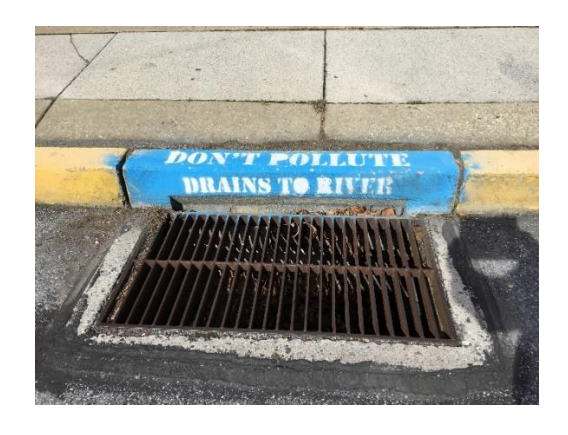
Corner of East Market & North New Haven Streets Marietta, Pennsylvania

These courses are based, in part, on The National Collegiate Honors Council program called "Partners in the Parks." This is an outdoor experiential learning program offered through a collaboration between NCHC and the National Park