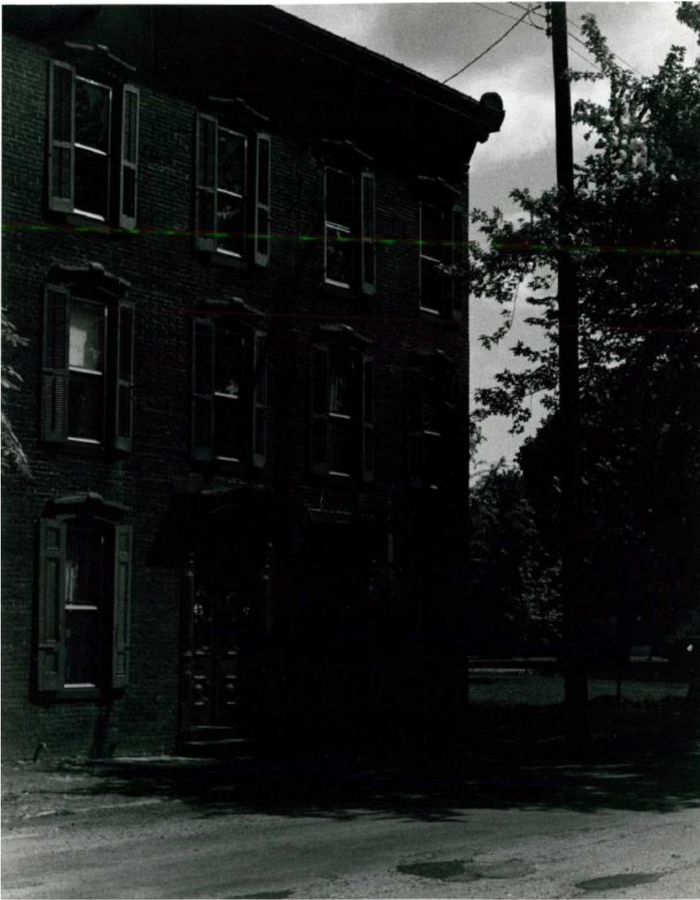
Hermitage Hotel – 466 E Front Street and S Bank Street