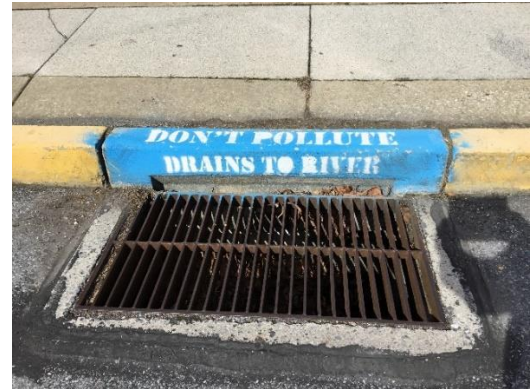
Corner of East Market & North New Haven Streets Marietta, Pennsylvania

initiatives and public works projects concerning re-building the Market Street Bridge.