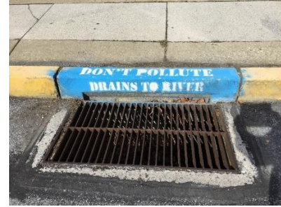
Corner of East Market & North New Haven Streets Marietta, Pennsylvania

In the spring of 2017 the course, “Elizabethtown History: Campus and Community,” involved a partnership with PennDOT. Students engaged in archival and field research to conduct National Historic Preservation Act Section 106 Reviews of local historic properties. Student research findings were published through the digital humanities project: ArcGIS story maps. Students’ reports were used by PennDOT, Elizabethtown Borough, and the federal Department of Transportation regarding historic preservation initiatives and public works projects concerning rebuilding the Market Street Bridge.