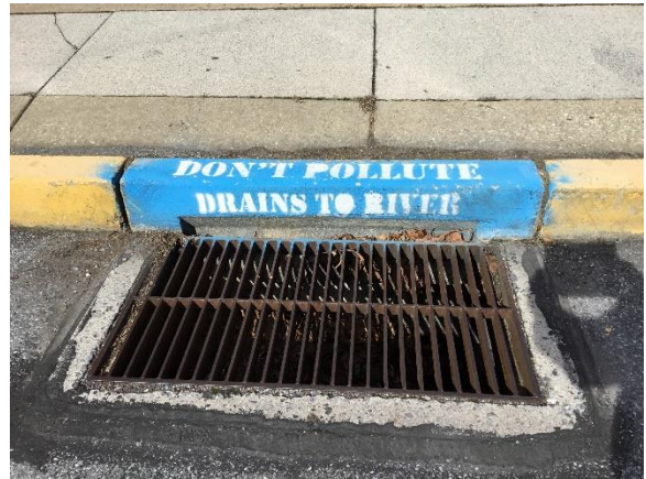
Corner of East Market & North New Haven Streets Marietta, Pennsylvania

research findings were published through the digital humanities project: ArcGIS story maps. Students’ reports were used by PennDOT, Elizabethtown Borough, and the federal Department of Transportation regarding historic preservation initiatives and public works projects concerning rebuilding the Market Street Bridge.