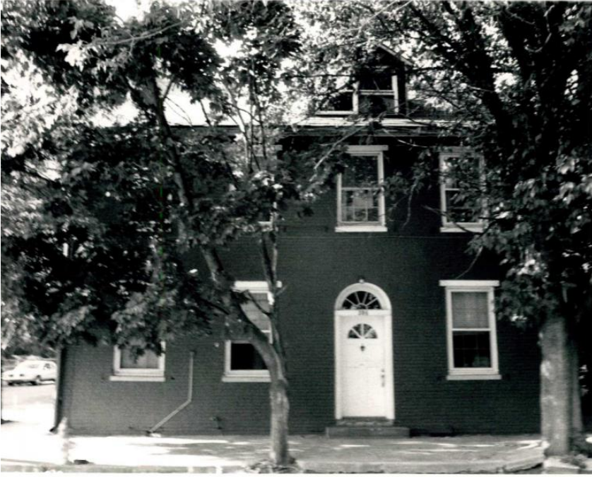
MARIETTA HISTORIC DISTRICT EXTENSION--LANCASTER COUNTY PD:1983 PV:S. FRONT ST. FACADE INV.#156