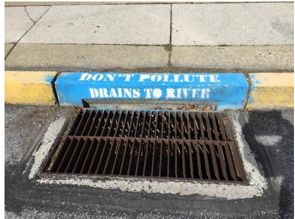
Corner of East Market & North New Haven Streets Marietta, Pennsylvania

Borough, and the federal Department of Transportation regarding historic preservation initiatives and public works projects concerning rebuilding the Market Street Bridge.