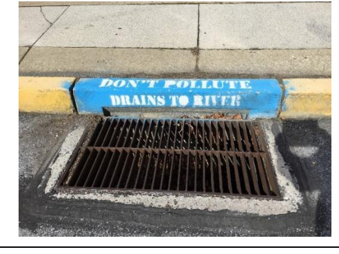
Corner of East Market & North New Haven Streets Marietta, Pennsylvania

the spring of 2017 the course, In "Elizabethtown History: Campus and Community," involved a partnership with PennDOT. Students engaged in archival and field research to conduct National Historic Preservation Act Section 106 Reviews of local historic properties. Student research findings were published through the digital humanities project: ArcGIS story maps. Students' reports were used by PennDOT, Elizabethtown Borough, the federal Department and of Transportation regarding historic preservation initiatives and public works projects concerning rebuilding the Market Street Bridge.