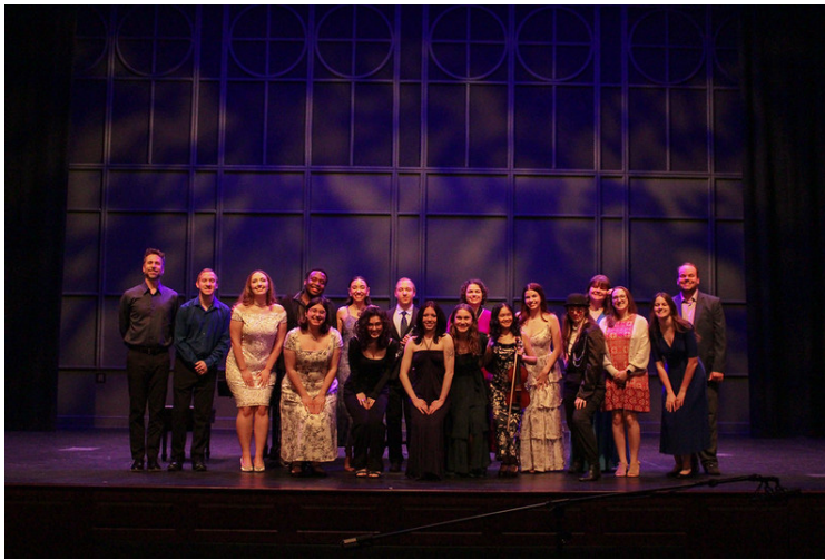
SCAD Recital 2025